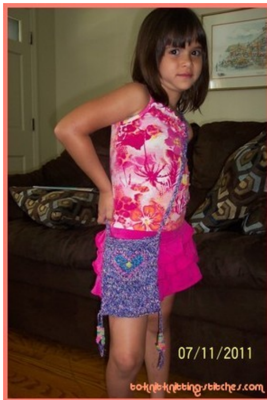
Image 1: Girl Shoulder Bag Knitting Pattern By Ratchadawan Chambers www.to-knit-knitting-stitches.com